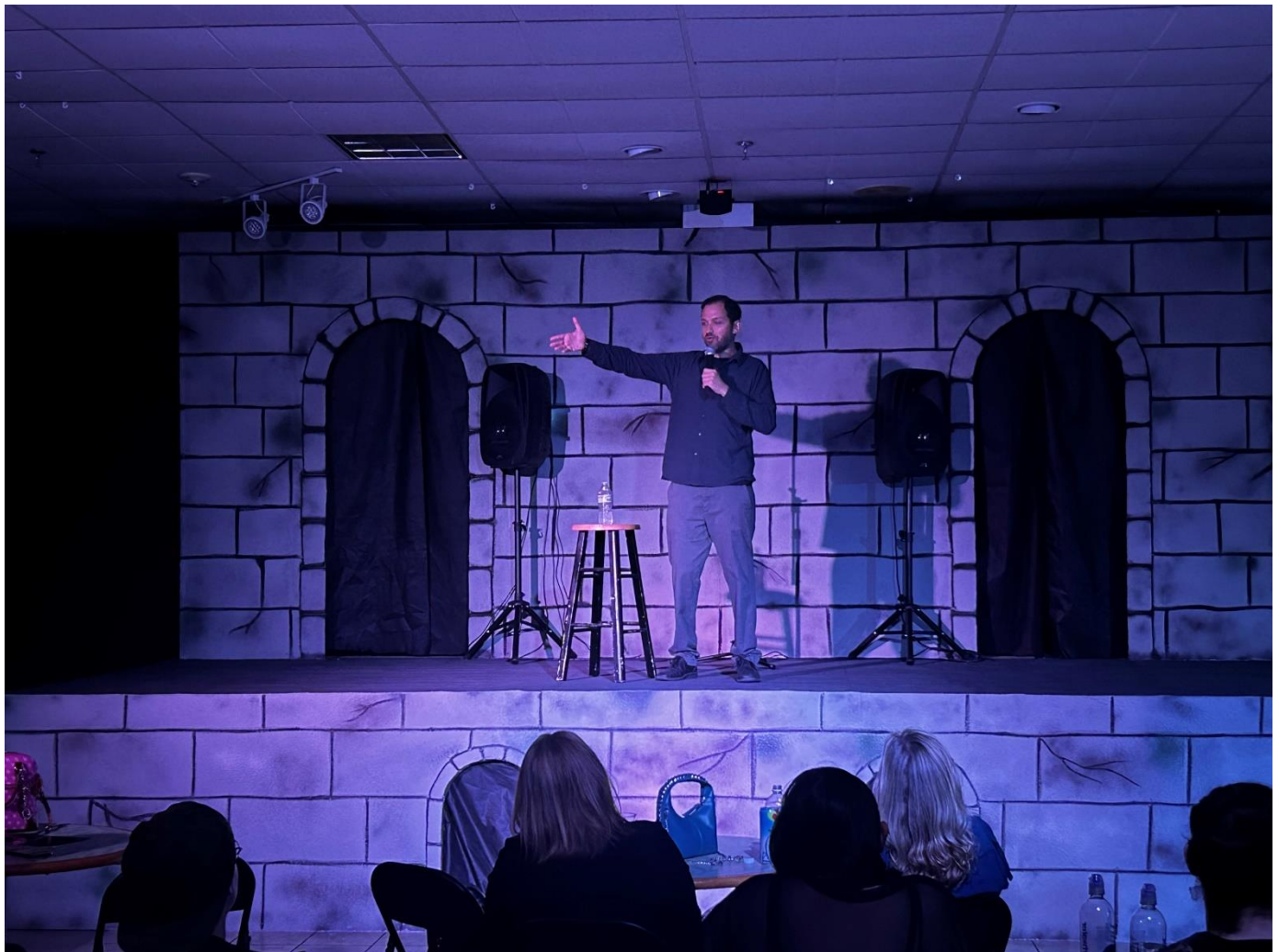
Headlining Festival of Fears