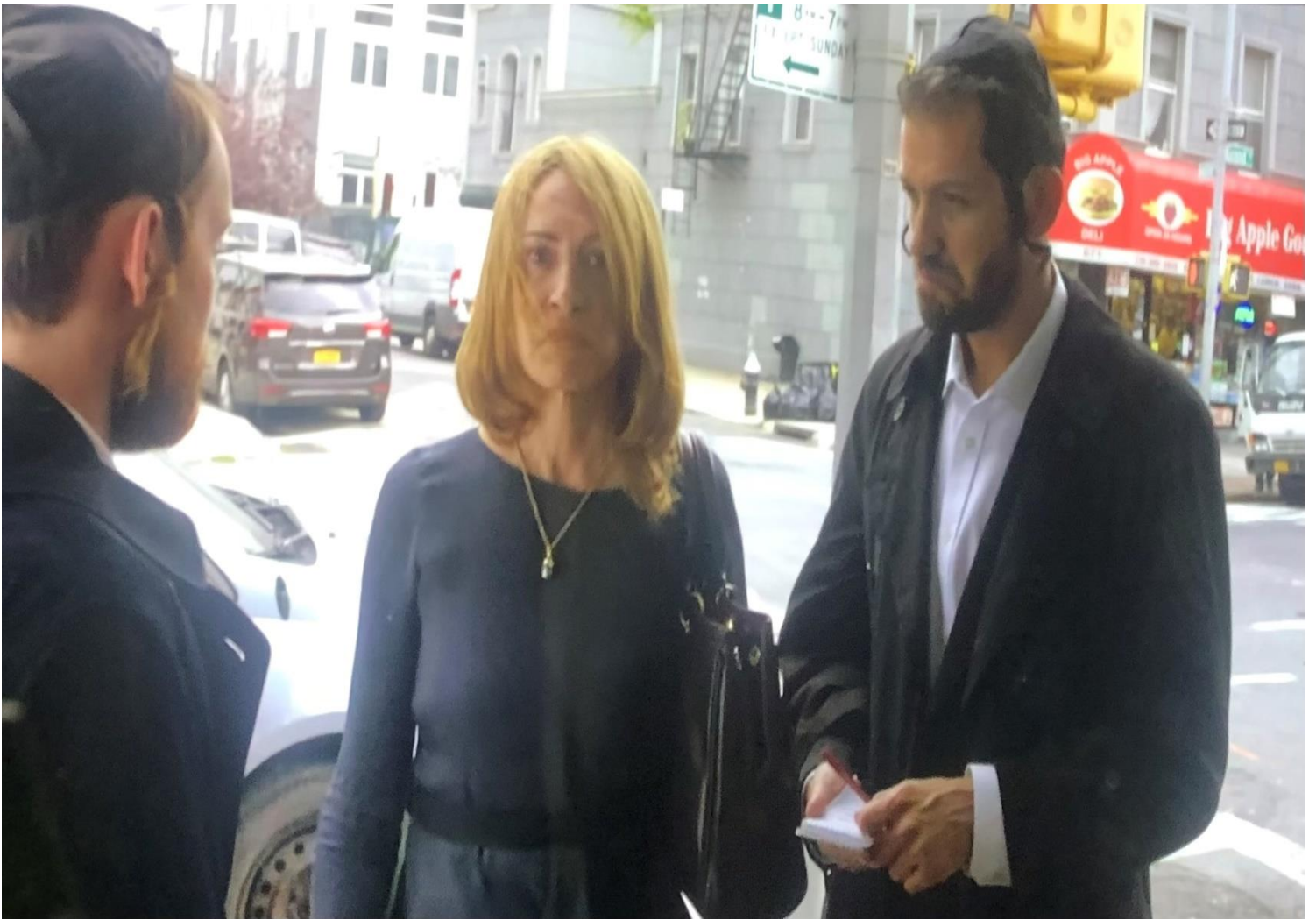
From the film Tango Shalom