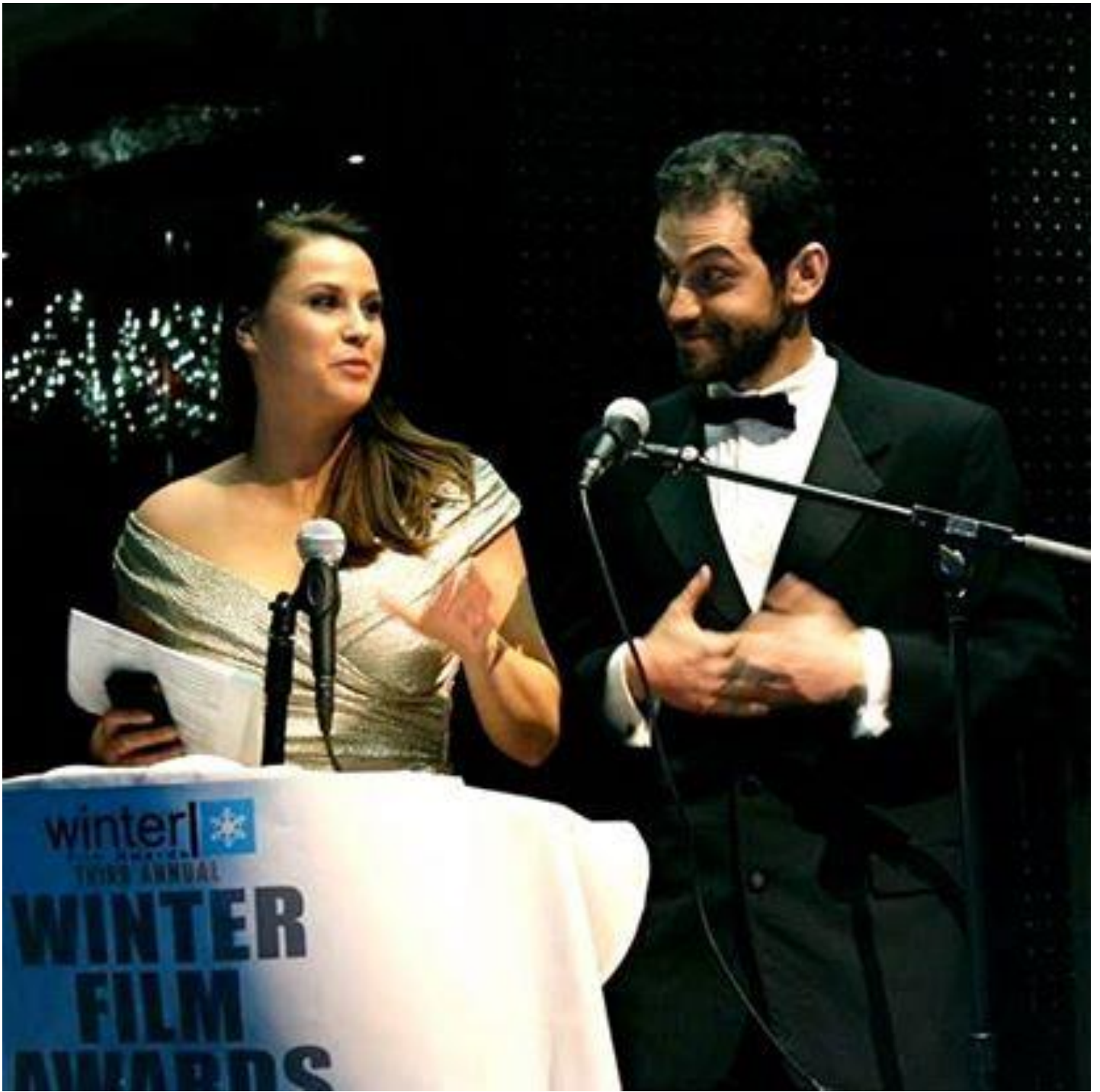
Hosting The Winter Film Awards