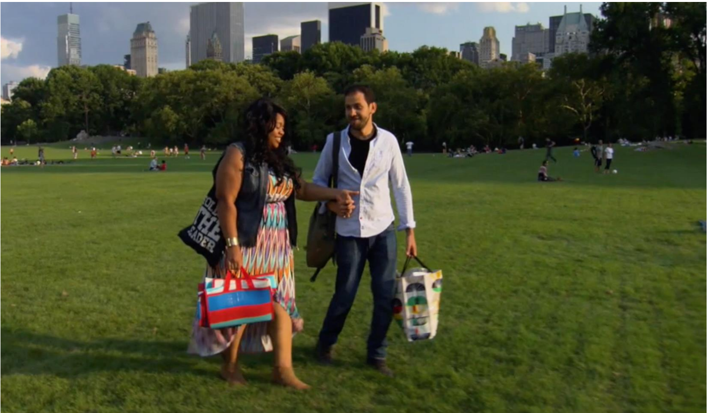
From Reality Shows on TLC and Lifetime