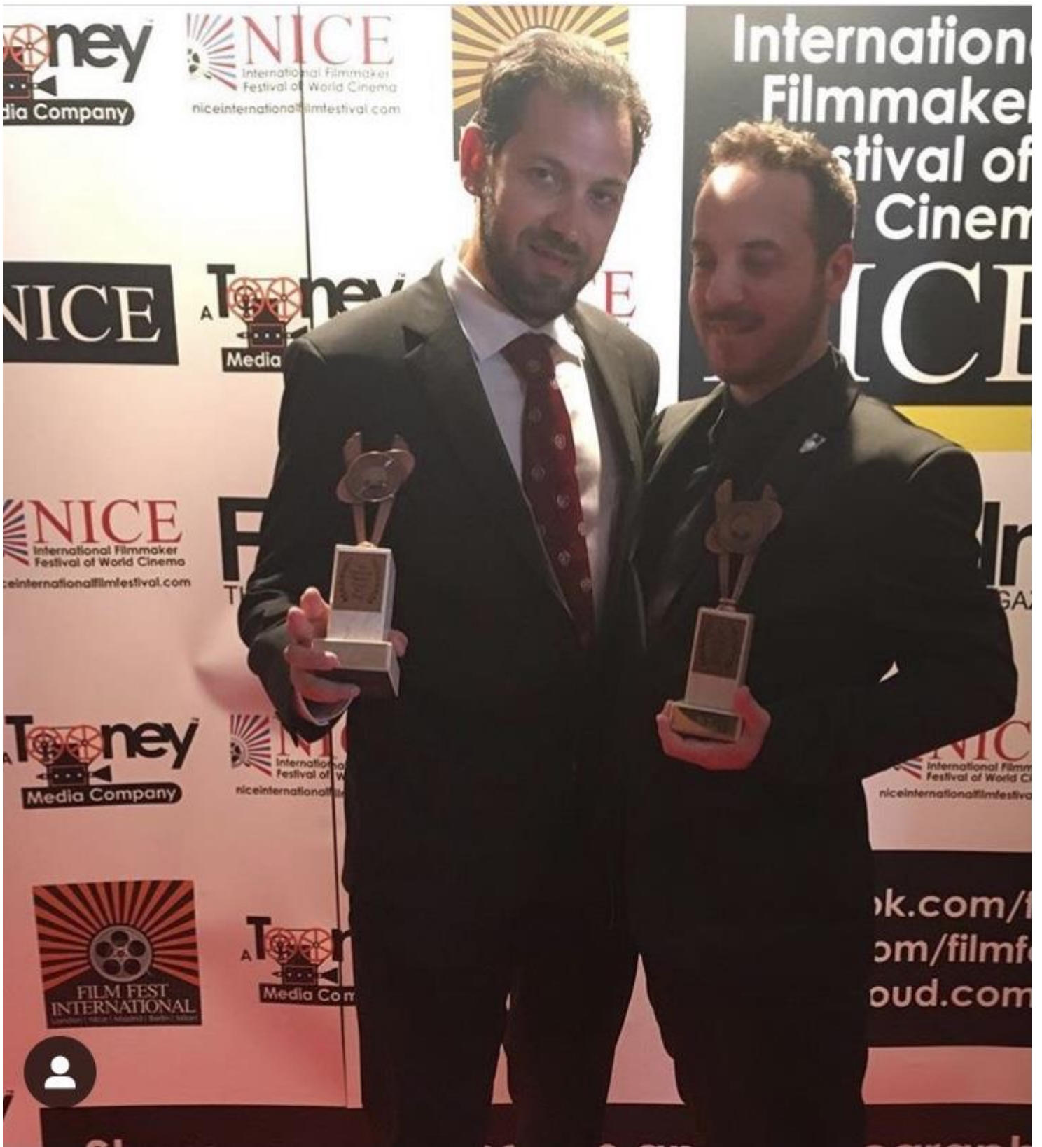
From The Nice International Film Festival