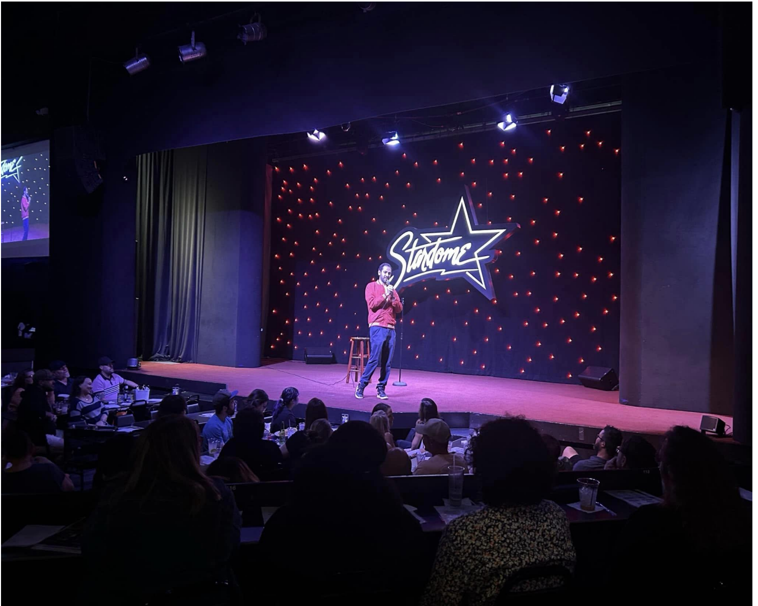
From X5 Contest At Stardome Comedy Club