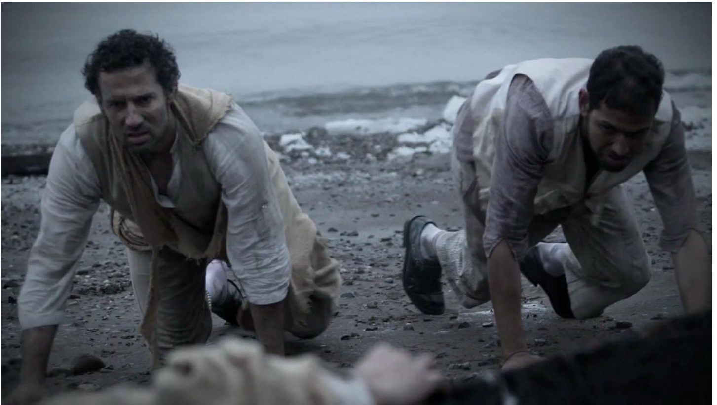
From The Travel Channel TV Series Monumental Mysteries