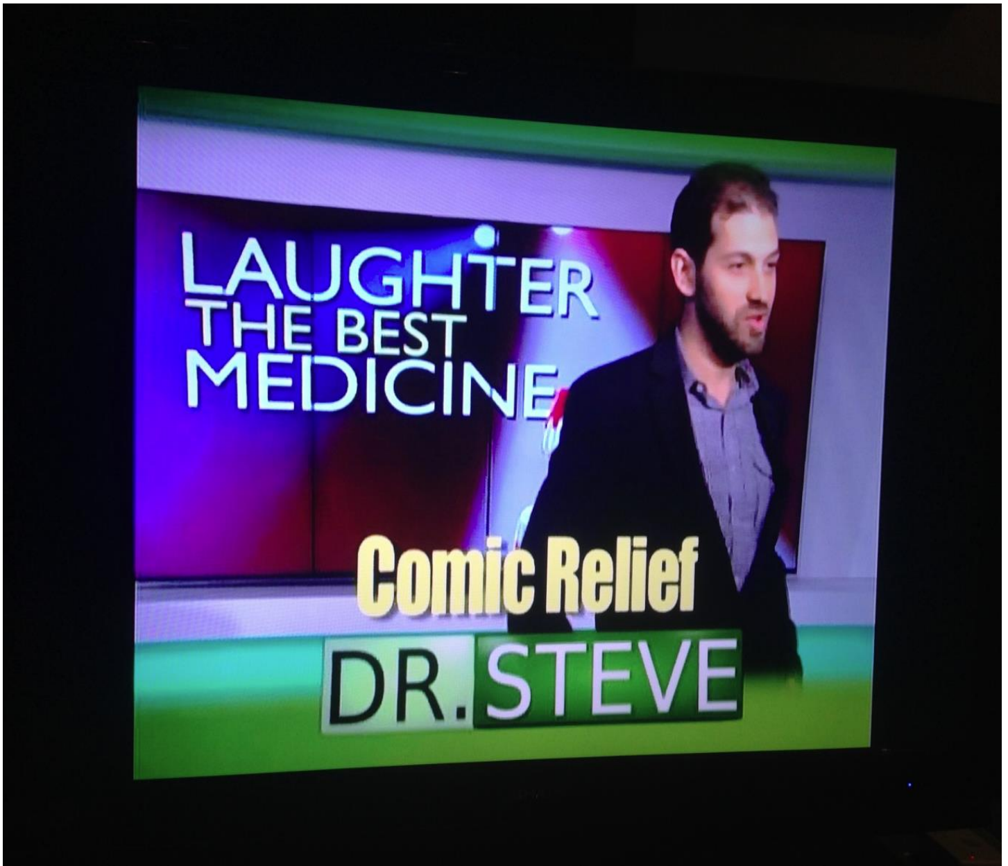
From The Dr. Steve Show