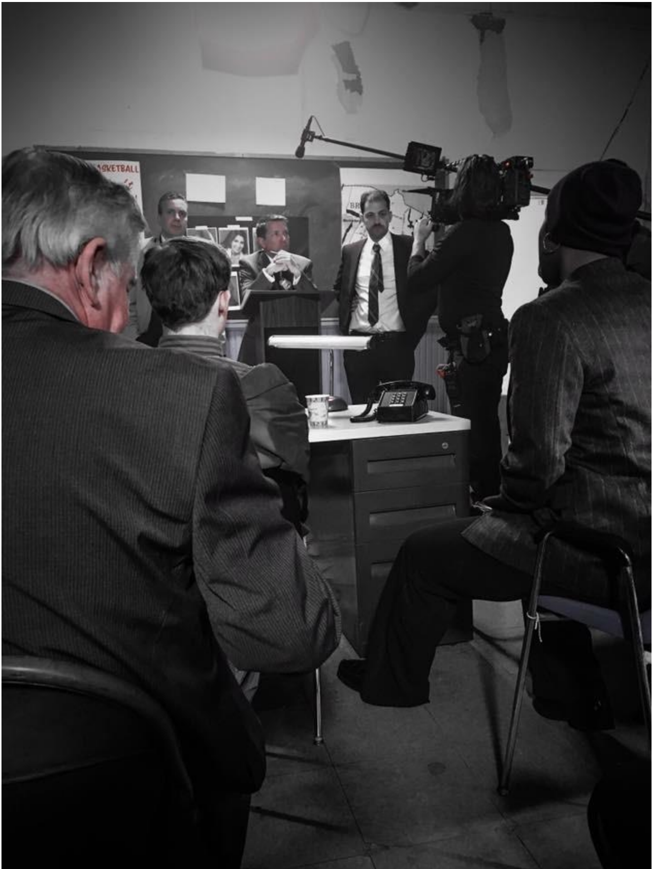
From The Discovery Channel TV series Street Justice: The Bronx