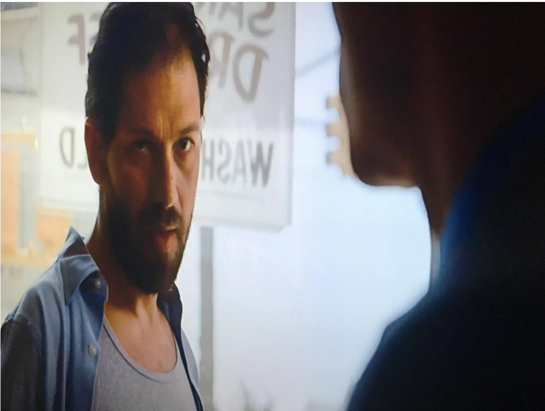
From Whistleblowers on Spike TV and Homicide City on Investigation Discovery