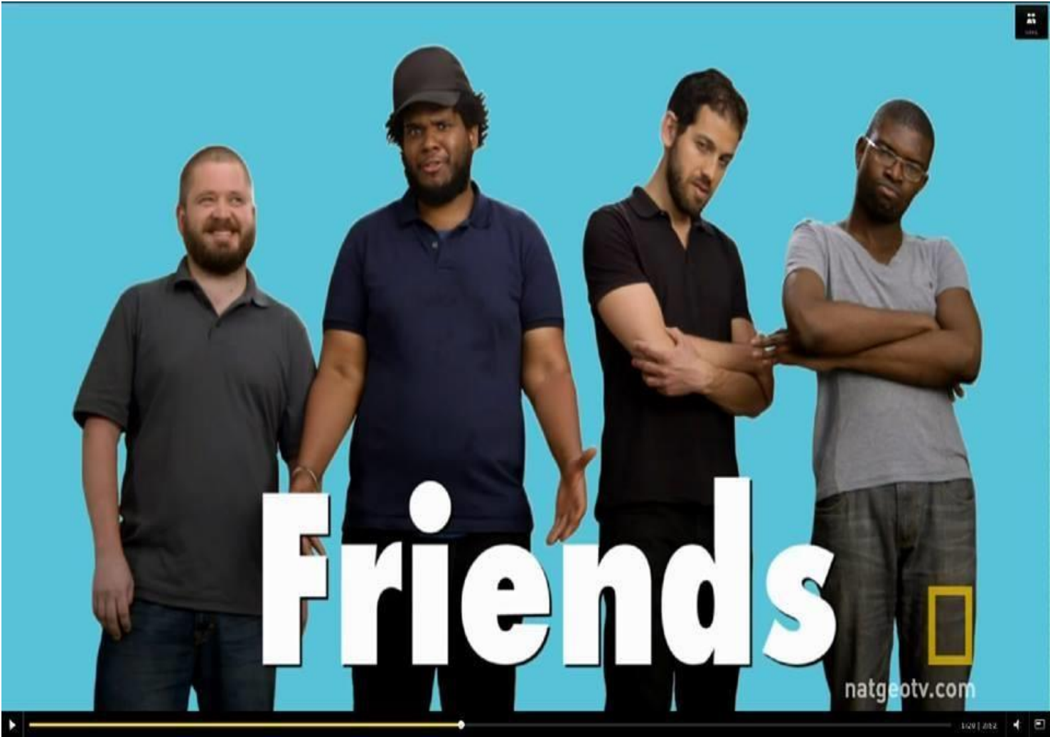
From The National Geographic show Brain Games