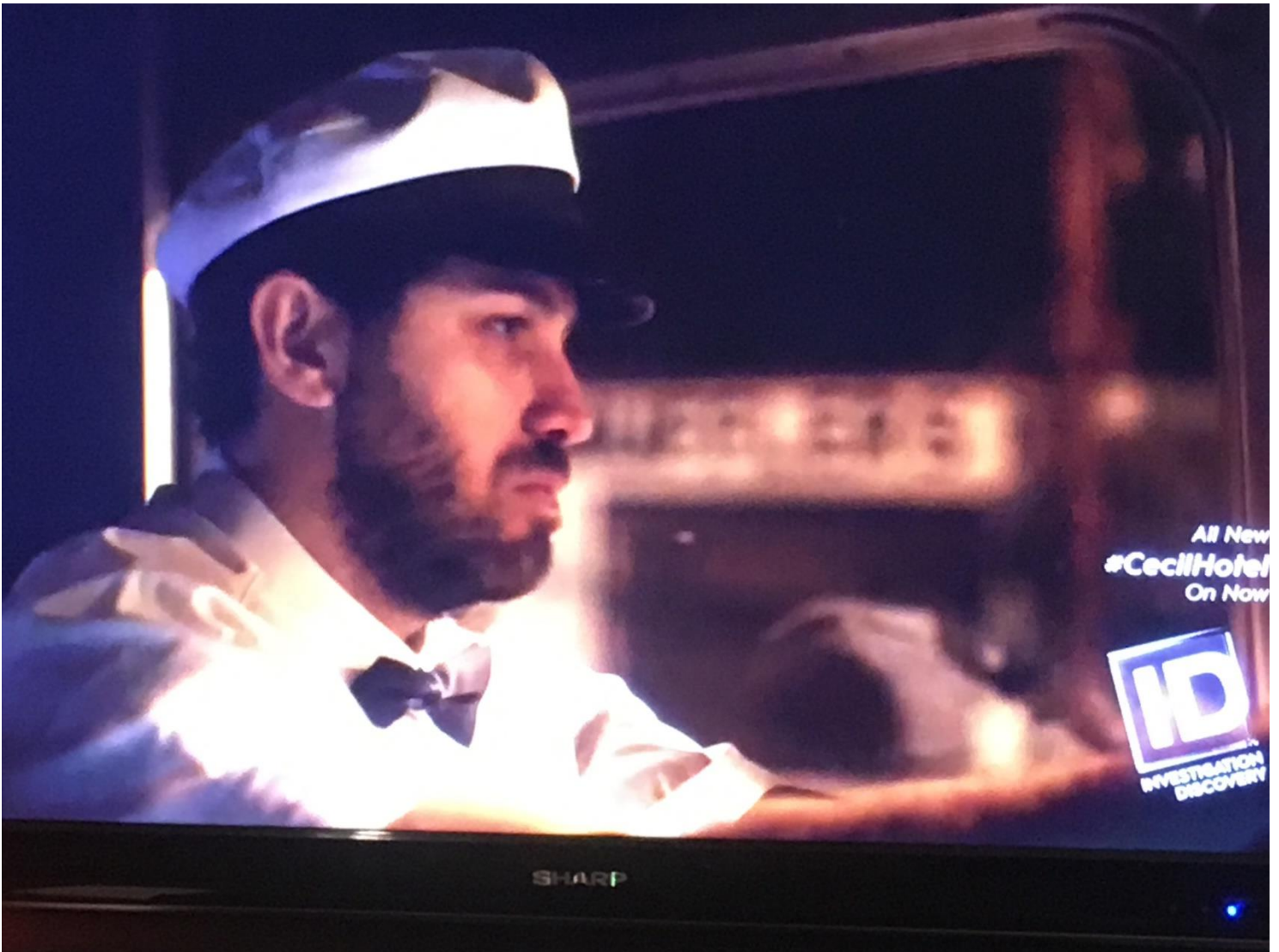
From the Investigation Discovery TV Series Horror at the Cecile Hotel