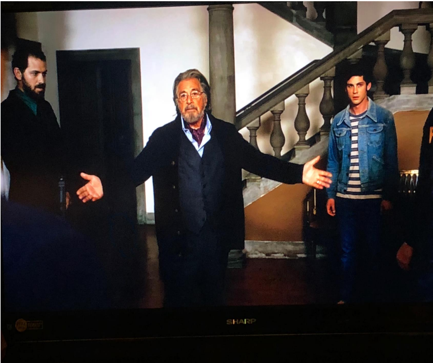
From Amazon TV Series Hunters With Al Pacino